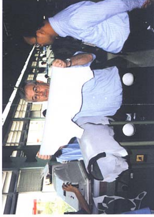
GHK starts with efficient use of input materials

This report could be the basis for an action plan for the company to implement the recommendations until the second visit of the team.