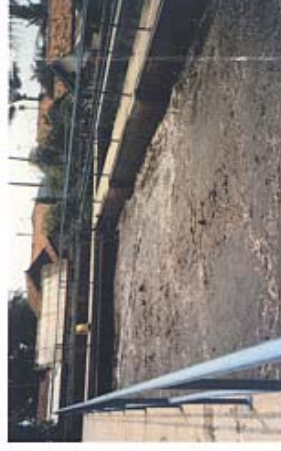
GHK leads to reduction of waste water